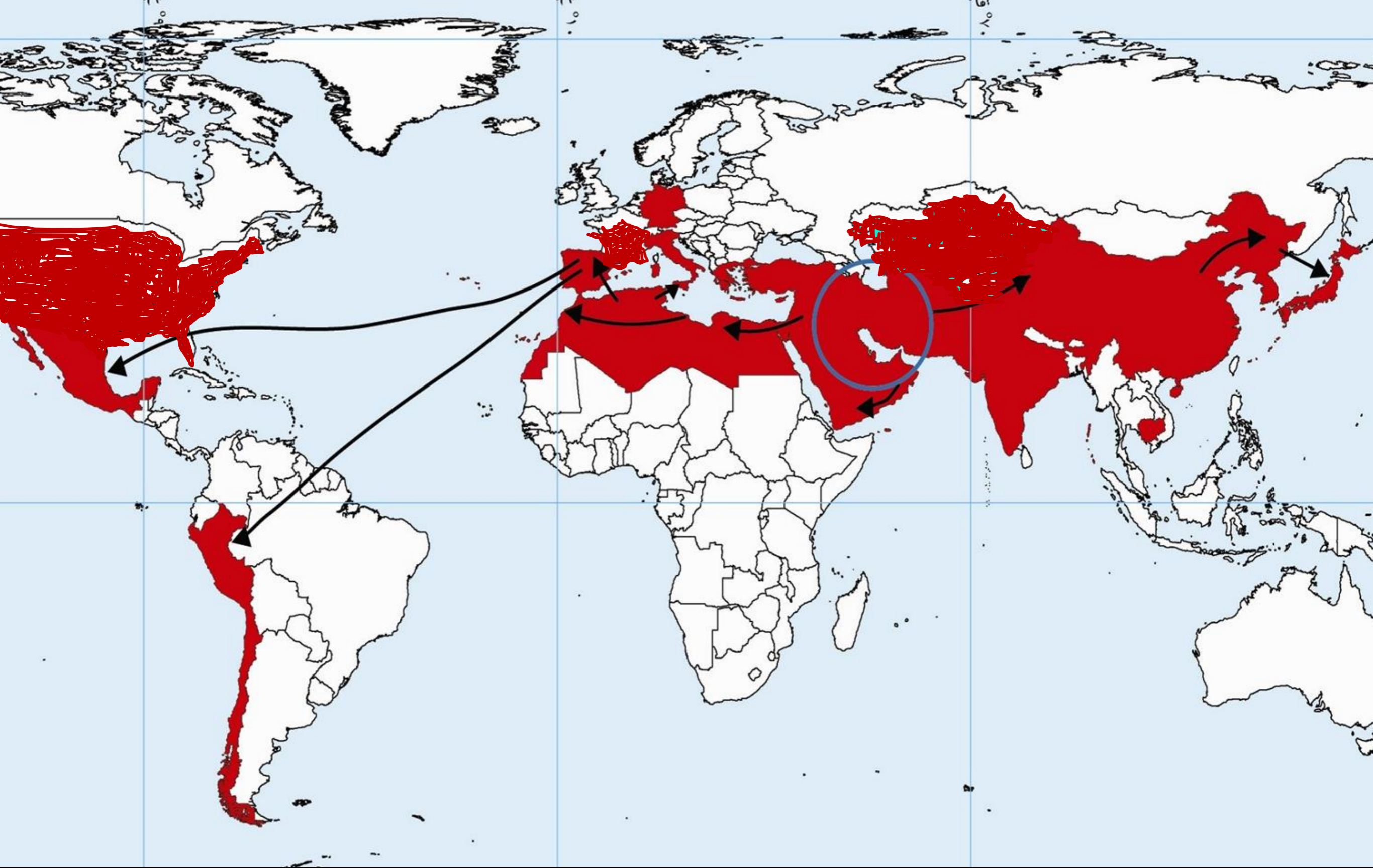
Countries with systems of water sharing like Aflaj (Aflaj, Khattara, Qanat, Karez, Saqiya, Foggara, Mambo, Galerias, Puquio, Ingruttati, Surangam etc)