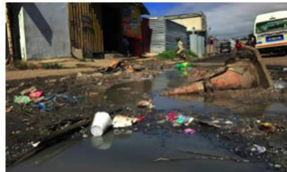
South Africa's ageing water infrastructure requires R330 billion(OMR 6,916,944,902.88) over the next 10 years