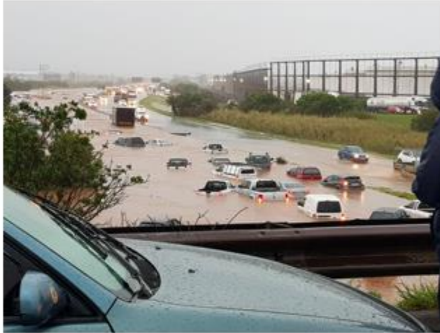
Poorly maintained stormwater infrastructure in KZN