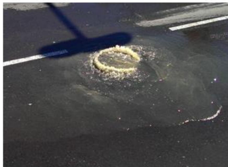
City of Joburg (smallest & most densely populated province in SA) experiences over 59,000 sewer blockages per annum: 5 blockages per km