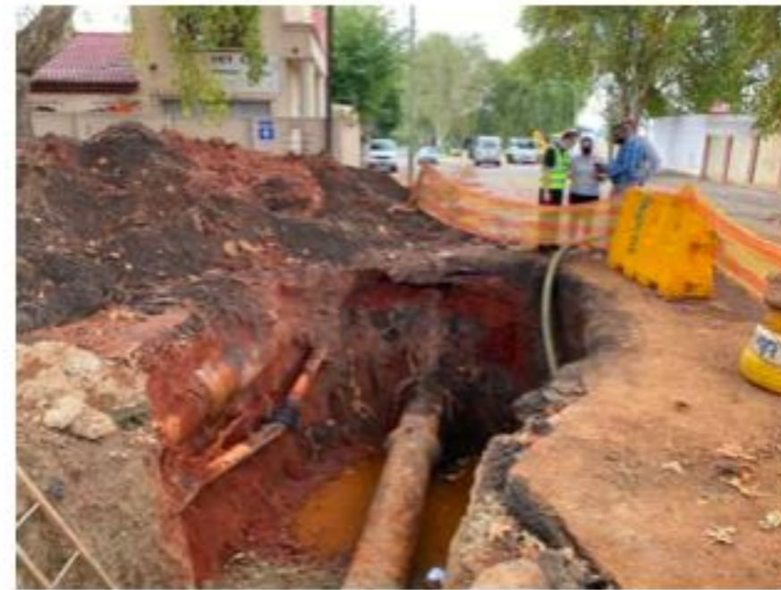
Increased shortage of reinstatements after burst