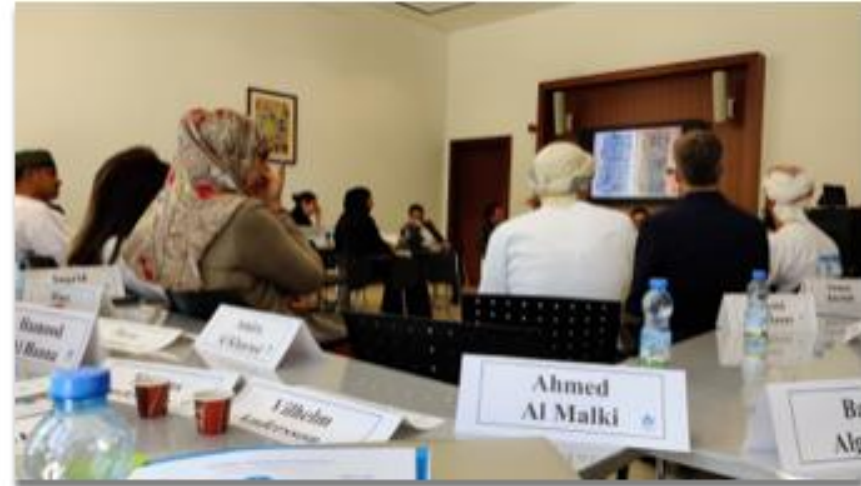
Photo taken at Water and Humanity conference launch, 13 November, 2019